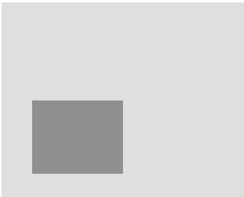
(a) Region of activation